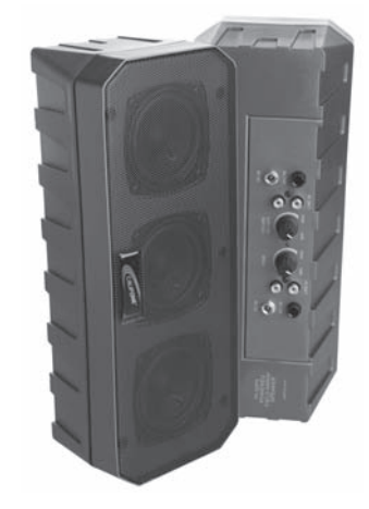
PI30-PS Powered Speaker